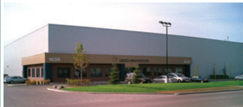
Headquarters - Toronto, Canada