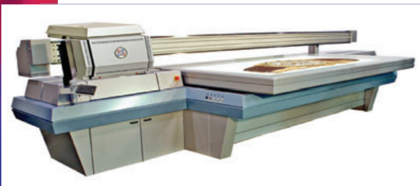
JETi UV Flatbed

"I've been designing and building high performance printers for quite some time now. I've had considerable experience evaluating and implementing other head types and supporting these heads in the field. Using Spectra printheads is a decision I have never regretted in all aspects."