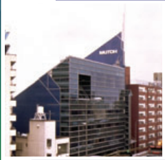
World Headquarters Tokyo, Japan