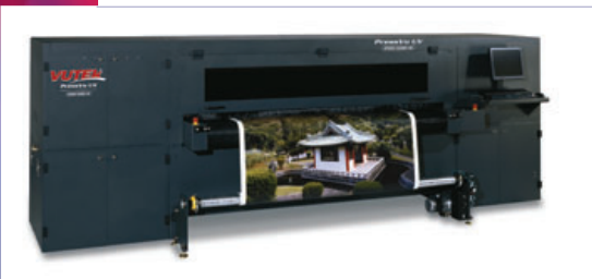
PressVu® UV 200/600 switches easily from rigid to rolled substrates

VUTEK® Inc., recognized as the world's leading supplier of superwide format digital inkjet printers throughout its 15-year history, offers a variety of printer models that feature different size, color, speed and resolution capabilities. The UltraVu® solvent product range, for high quality, high speed, superwide roll-to-roll printing, is available in 1.5-, 2-, 3-, and 5-meter formats, while the PressVu® UV family of digital inkjet flatbed printers uses UV-curable inks to print high quality images on both rolled and rigid substrates.