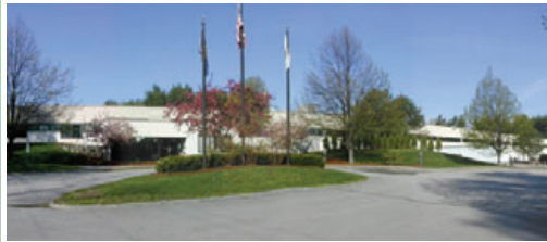
Headquarters, Meredith, NH