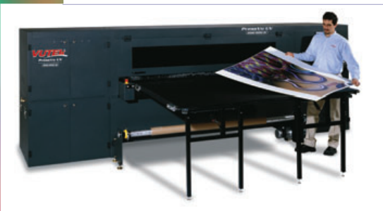
PressVu® UV 200/600 Digital Inkjet Flatbed/Roll-To-Roll Printer