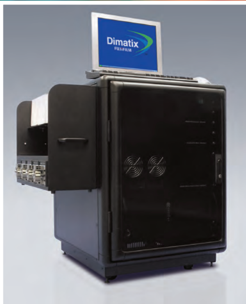
Apollo II PSK