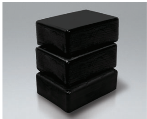
Sabre Hot Melt Ink